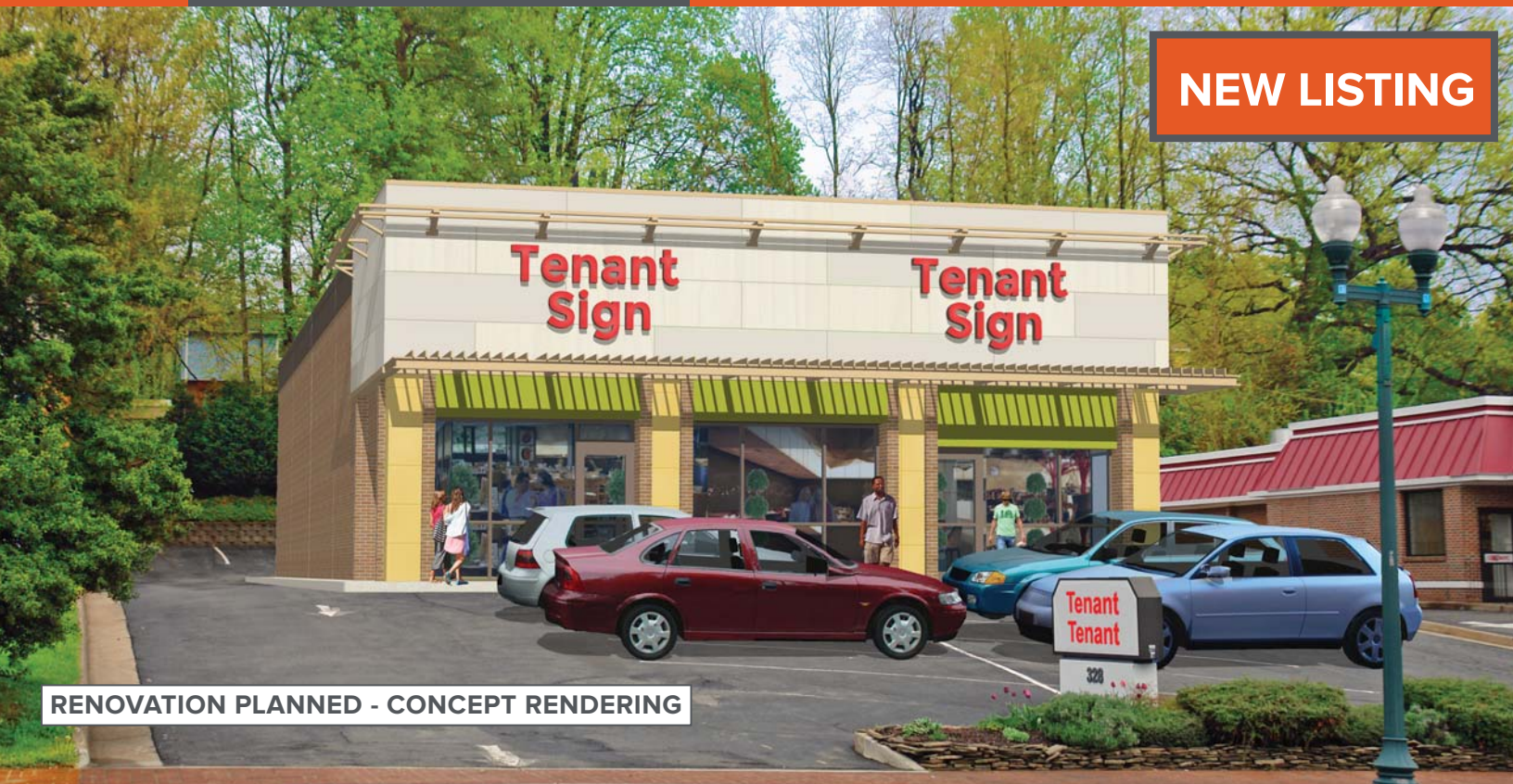
RENOVATION PLANNED - CONCEPT RENDERING